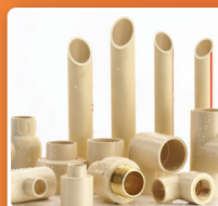
Plumbing & Waterproofing