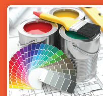
Paints & Polishes