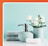
Bathroom & Accessories