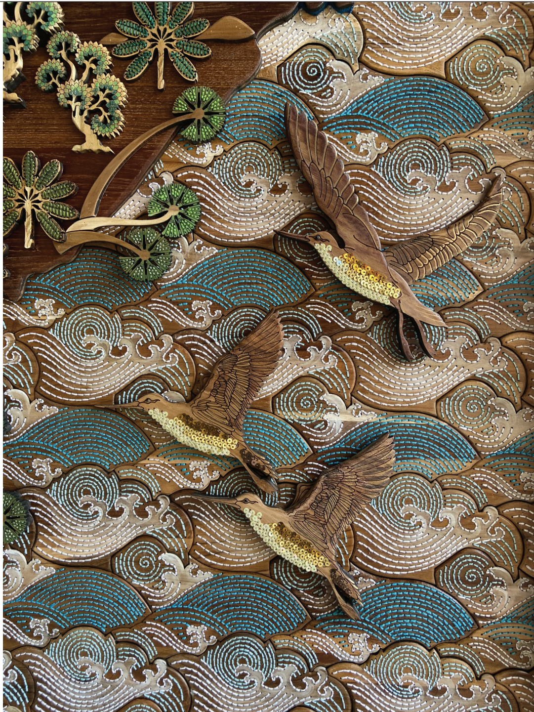
part sized image of 'Bharatvarsh' 3ft x 6ft