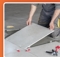
Tiles & Flooring