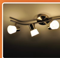
Electrical & Lighting