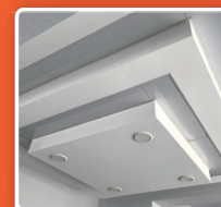
Ceiling & Partitions